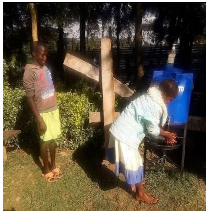
All the students make sure to wash their hands to stay healthy!

Funding to protect Daylight students, staff, and volunteers was provided by a Special COVID-19 Health Appeal made in April and May of 2020. These funds, in combination with funds raised during our Fall Gala, helped protect against COVID-19. The good news is that no students or staff tested positive in 2020! Thanks to everyone who contributed funds to meet the health challenges brought forth by the pandemic. In November and December, a Special Tent Appeal was made to procure funds needed to purchase three tents. These tents would be needed when the school welcomed all students back to campus. The tents were purchased at the close of 2020. Again, thank you to all who contributed to this important project.