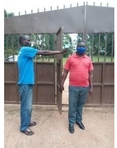
Taking precautions with COVID-19

The quote above is from a long time Daylight School enthusiast in the USA. The comment captures how the shared experience of a pandemic in 2020 made for closer ties between the Daylight School community and its supporters in the USA. Hardship and worry have been our common bond. But so is a closer relationship forged by the ways we have been required, in our respective homelands, to care for loved ones and to keep children engaged while away from school. Throughout 2020 Daylight students, staff and leaders in Kenya have drawn upon their tireless spirit to continue Daylight’s mission. Despite the challenges of COVID-19, the effort to provide high quality education, a safe and engaging campus, nutritious meals, and a breadth of experiences continued. The goal of empowering students to imagine and create a more peaceful and prosperous future for the people of West Pokot was not lost to the pandemic. Our Daylight Family – in Kenya and in the USA continued its work.