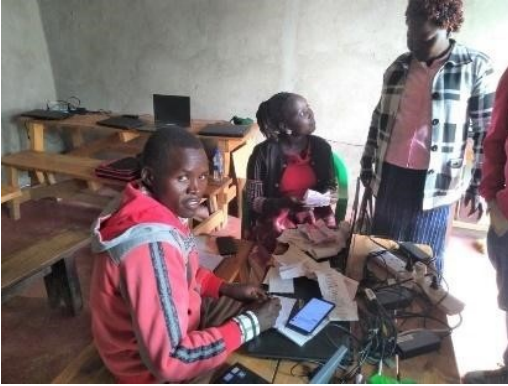
Our Daylight leaders taking care of the paperwork and record keeping that are so important for the school.