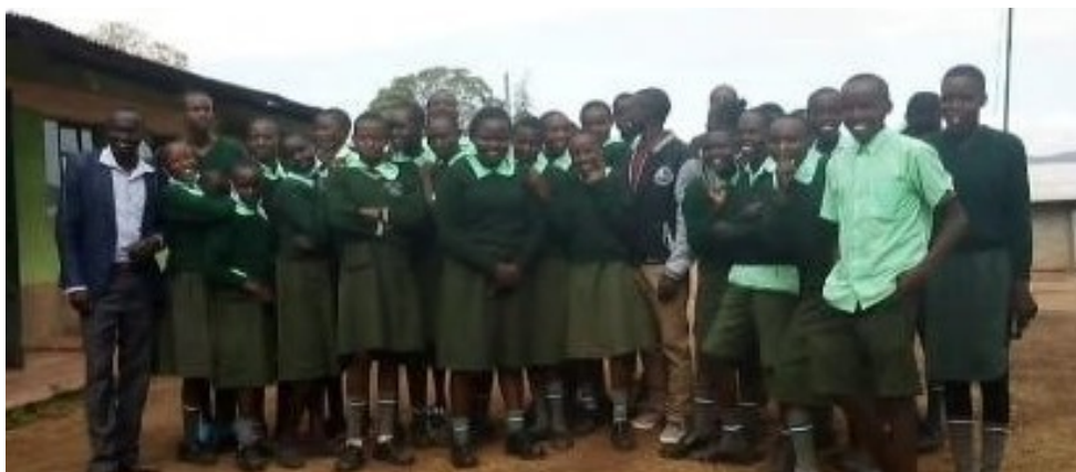
Daylight’s 2021 8th Grade Class

standardized testing. The national standardized test is crucial in determining eligibility for high school scholarships and placement in a high school where students have a high probability of qualifying for a university education. We are so proud of our 8 th graders! In 2020 our students placed 4 th highest out of 600 schools in Pokot County! We were pleased that in addition to the 8 th Grade, our 4 th graders were also able to return to the classroom! While test preparation is especially important this time of year, we also value the overall educational experience at Daylight which exposes students to a wide variety of learning experiences in the classroom and beyond.